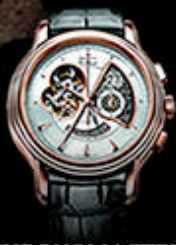
CHRONOMASTER COLLECTION view