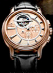
ACADEMY COLLECTION view

From the meticulous cut of a main plate to the patient assembly of our watches, from the plans for a mechanical movement by the construction engineer to the design of the case by the artist, beauty is eternally present.