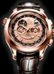
CLASS COLLECTION view