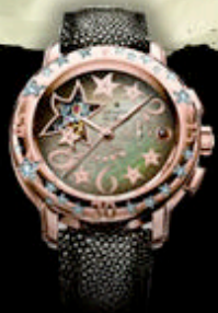
BABY DOLL COLLECTION view

Zenith pays tribute to women... because women are the stars in our lives. Never completely the same, but never really a different person, today's woman has many faces. And because every woman is unique, Zenith is proposing rich and varied collections that will adapt to her every desire.