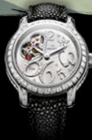
STARISSIME COLLECTION view