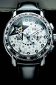
STAR ROCK COLLECTION view