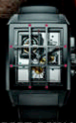
PORT-ROYAL COLLECTION view