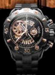
DEFY COLLECTION view