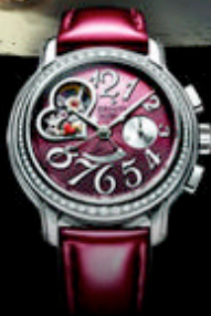
QUEEN OF LOVE COLLECTION view